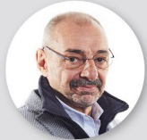
CLO Chief Legal Officer