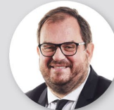
OPTO DISPLAY LCD Michele Giusti