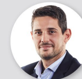
OPTO LED Tiziano Fegatelli